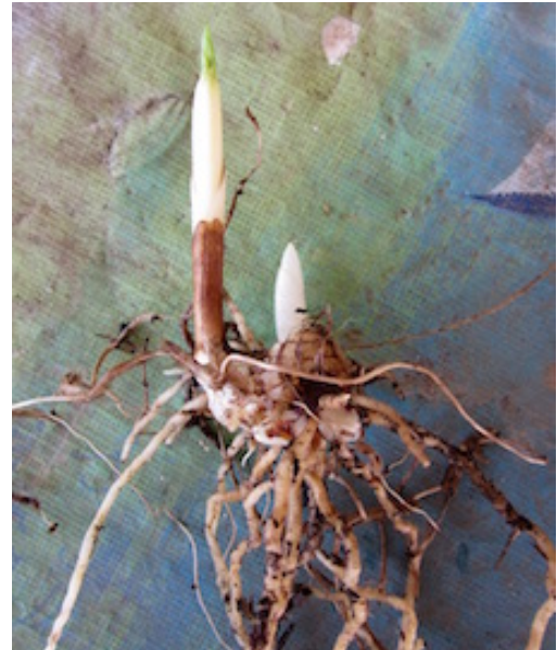
New shoots in early June

Mealy bug can be difficult to control as it can hide below the ground surface in the pseudobulbs. It is particularly active as the leaves die off in autumn. In this case it may be necessary to remove all the old dead tissue when the plants have died back and soak the bulbs in insecticide.